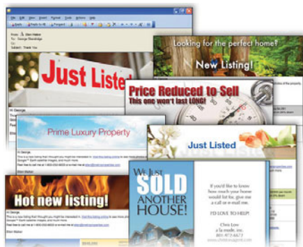
Professionally designed real estate specific ads