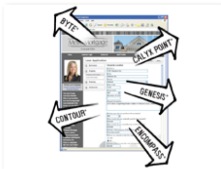
LOS integration tools eliminate retyping, errors, and saves time