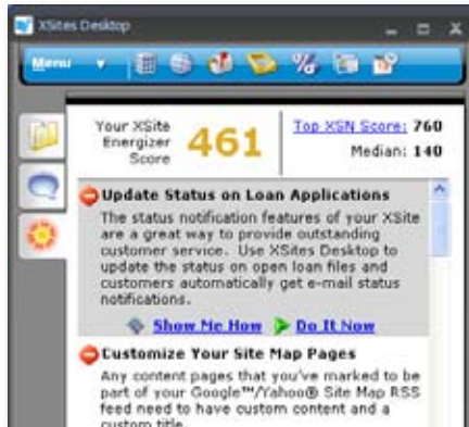
XSites Desktop combines all your web tools in an easy to use, always on window on your desktop.