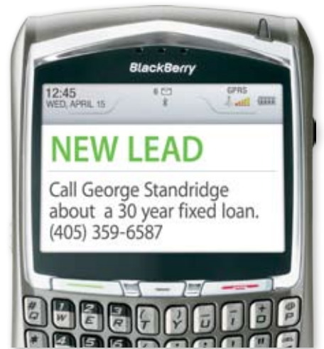
New leads are delivered to your cell or PDA.