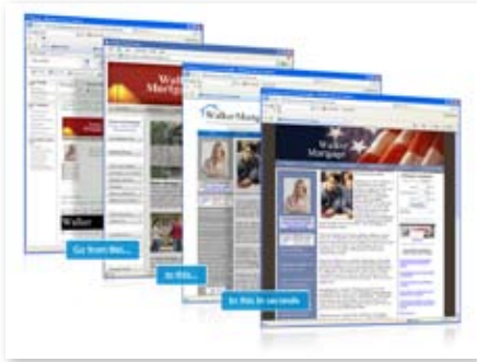
Designer themes and simple backend interface allow for a unique, professional site in a few clicks.